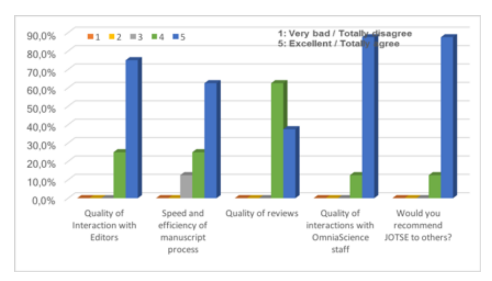
Figure 2. JOTSE author survey results 2016

For this 2017 we are foreseeing new challenges, such as the increase in the number of submitted articles as well as making an extra effort to keep our reviewers' fidelity. As we can see in the Figure 2, We can improve on our quality of review, if our reviewers feel more involved with JOTSE and we will work this year for that.